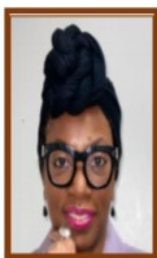
April 28 International Human Trafficking Institute